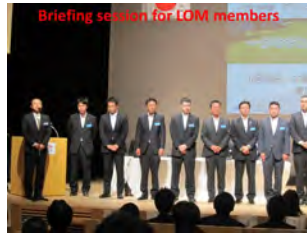
Briefing session for LOM members