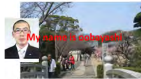
JYOUKOU TEMPLE IS MY Workshop place