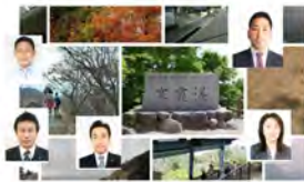
SHOUD ILAND Member