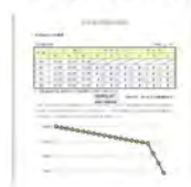
reality of our island