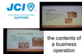
the contents of a business operation