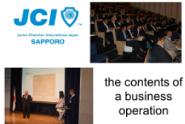
the contents of a business operation