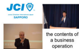
the contents of a business operation