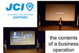
the contents of a business operation