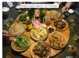
Traditional meals of Taiwan